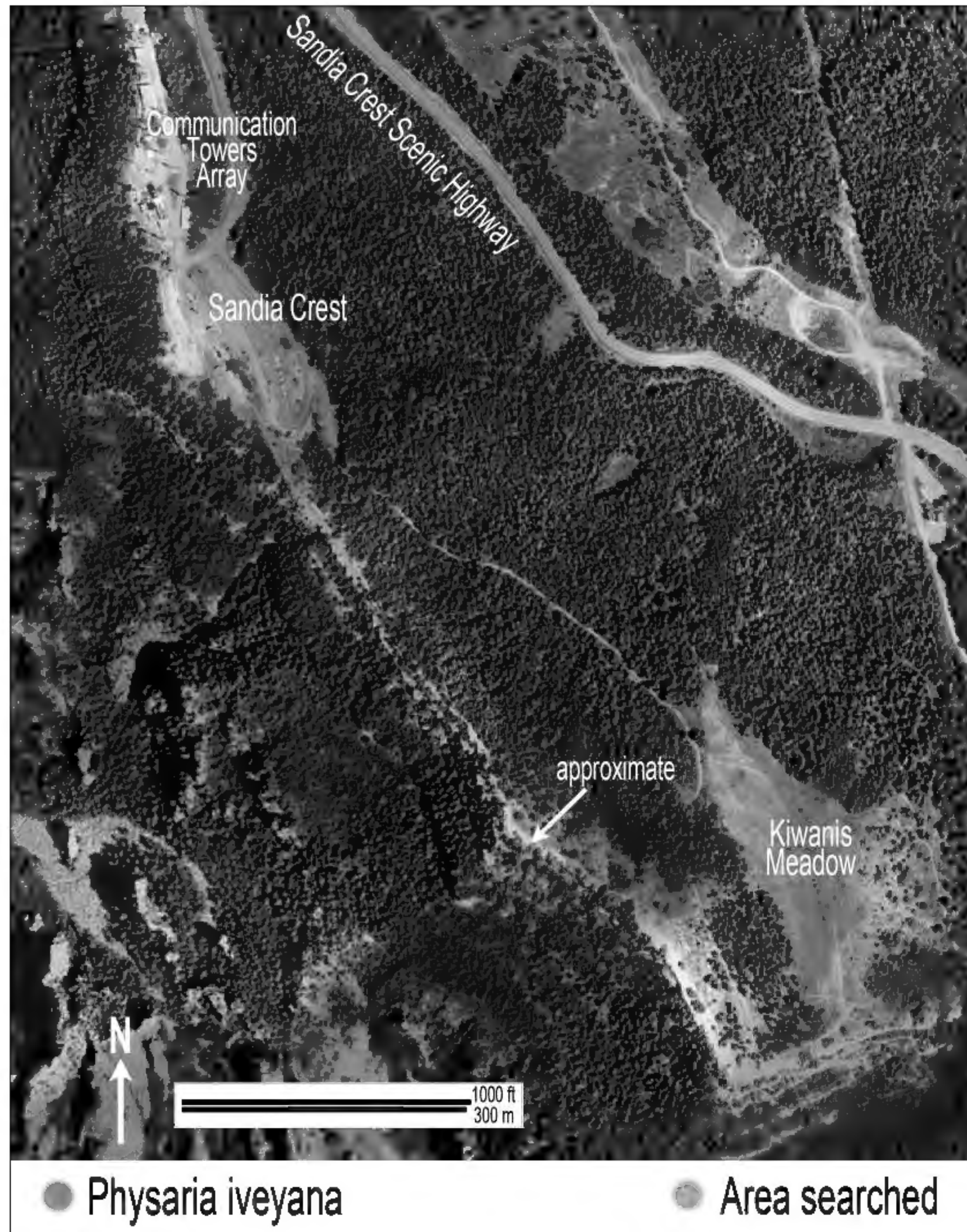
Figure 2. Locality of type collection and additional local area searched.

of drawing of species which cleverly focused in on the most important characters for identification. In 2008 the greatly expanded fifth edition was published, illustrating more than one third of the species known for the state. Flowering Plants of New Mexico is likely the most consulted plant identification reference in the state and is used as a text in the Flora of New Mexico course at the University of New Mexico. Ivey has given numerous talks, workshops, and field trips throughout the state. His work has done much, perhaps more than any other, to stimulate interest in the plants of New Mexico and their appreciation and preservation.